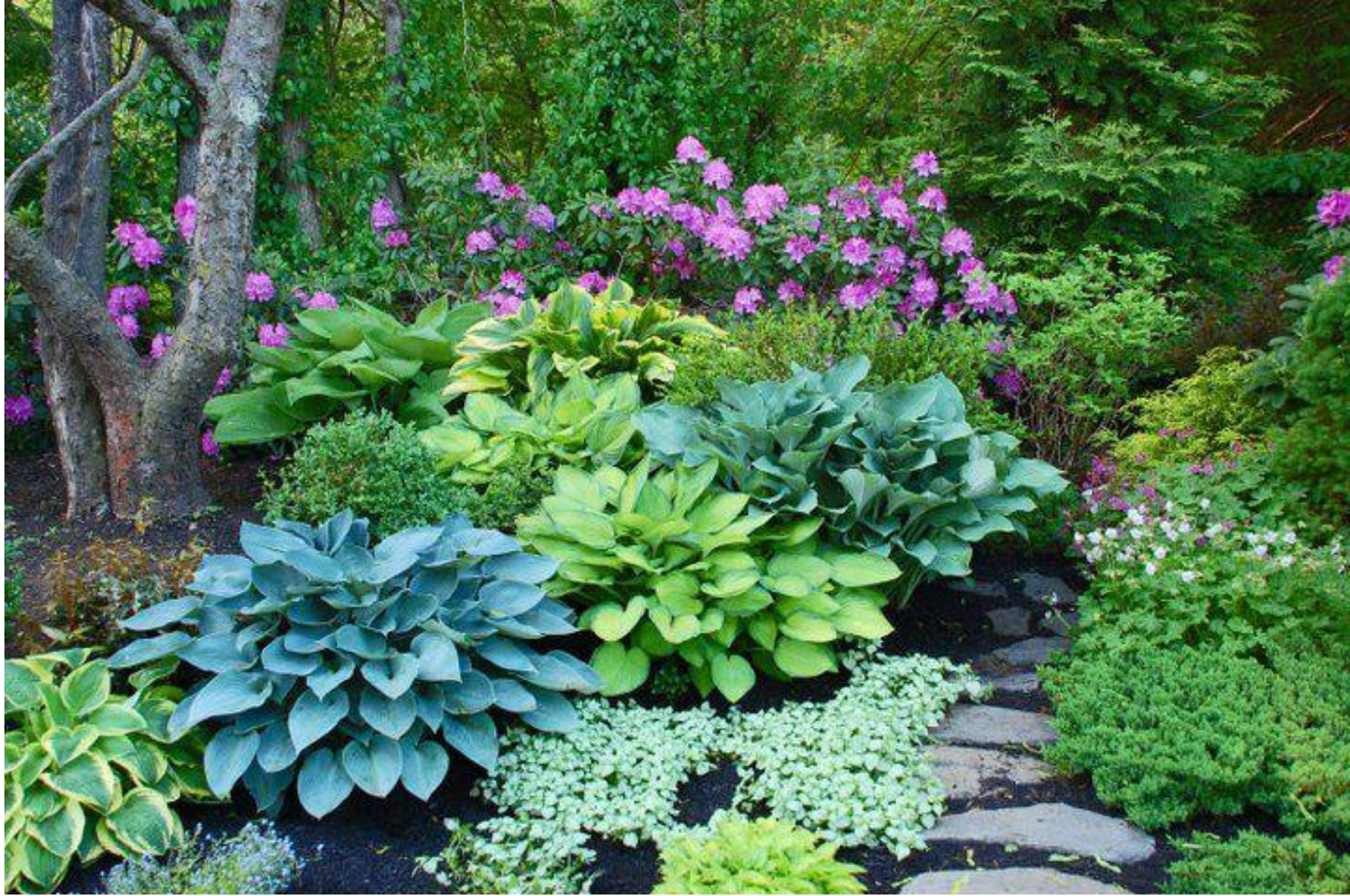
Shrubs for Shade