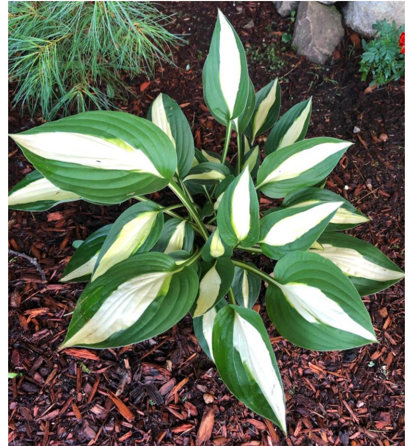
Cool as a Cucumber Hosta (dk gr white center)